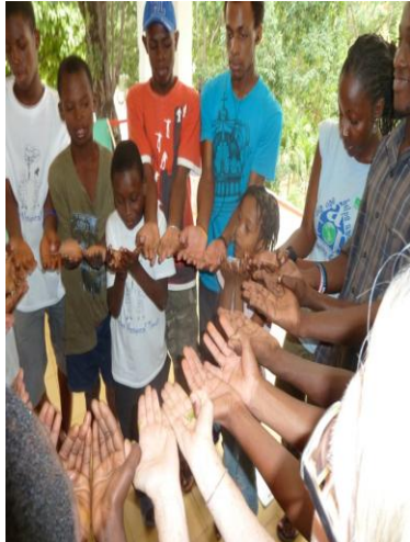
The Ubuntu circle of oneness at the end of our energizing exercises

questioned the scientific validity and research basis for our model which required us to address them and give the scientific rationale. We were encouraged to see the growing interest in psychology and mental health in Haiti. We have found it exhilarating to be able to spend two days educating them on the 7- Step Integrative Healing Model as well as hoping that their very positive response to the meditation might lead them to integrate it into their own everyday lives. They completed the Harvard Trauma Questionnaire as well as the Heartland Forgiveness Questionnaire, both of which the students had completed at the conference, in order to assess changes over a week's time after having been given the training by the ATOP Team.