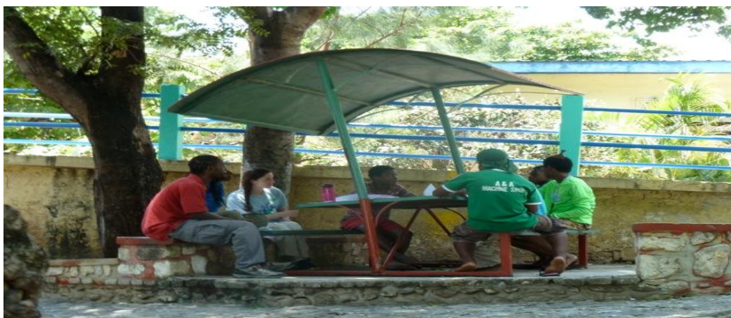
ATOP Team processing with translators and other team leaders at the orphanage