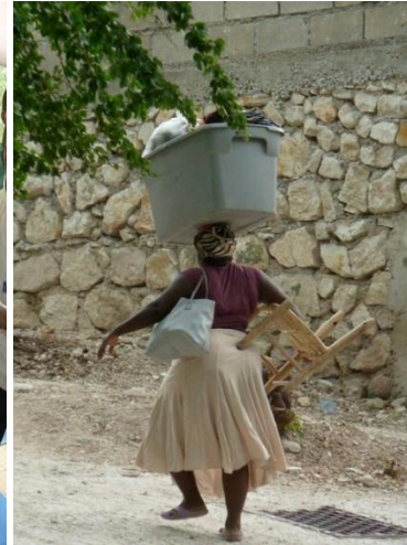
Struggles for each day